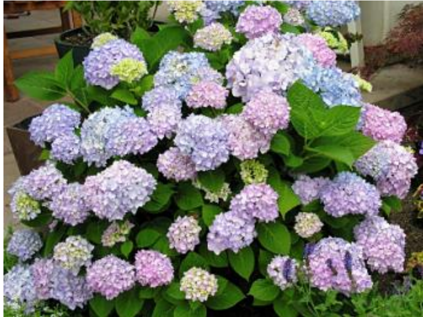
Figure 24 - Hydrangea Endless Summer

In the past few years, hydrangeas have made a HUGE comeback! New flower forms, and massive flowers are all part of the reason - but 'repeat' blooming is the key to this trend. Hydrangea used to be a once-a-year bloomer, but the new variety 'Endless Summer' has changed that trend. Now we expect at least two cycles of flowers and with twice as much show, the plant has found new places in the garden. Good for semi-shaded areas, this is an easy shrub to grow with minimal care. Advanced gardeners can manipulate the flower colour by adjusting the soil pH. A pH of 5-5.8 (acidic) makes the flowers blue toned. A higher pH will yield white/pink flowers. Cut back the old wood in the winter and let this great plant grow to about 1-1.2m tall in the garden.