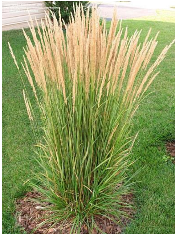
Figure 66 - Avalanche Feather Reed Grass