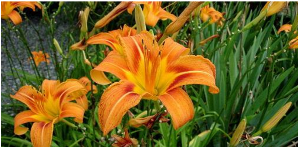
Figure 7 - Day Lily Flower

Size: From 6 inches to 4 feet in height.