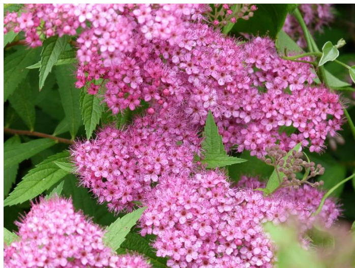
Figure 19 - Spirea flower close up available in many colours and shapes