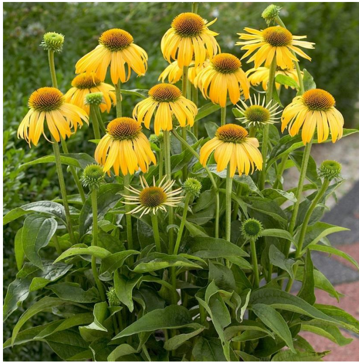
Figure 40 - Harvest Moon Coneflower