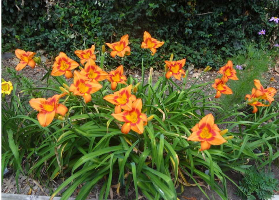
Figure 13 - Orange Crush Daylily

Flower: Vivid, deep orange with a rose centre