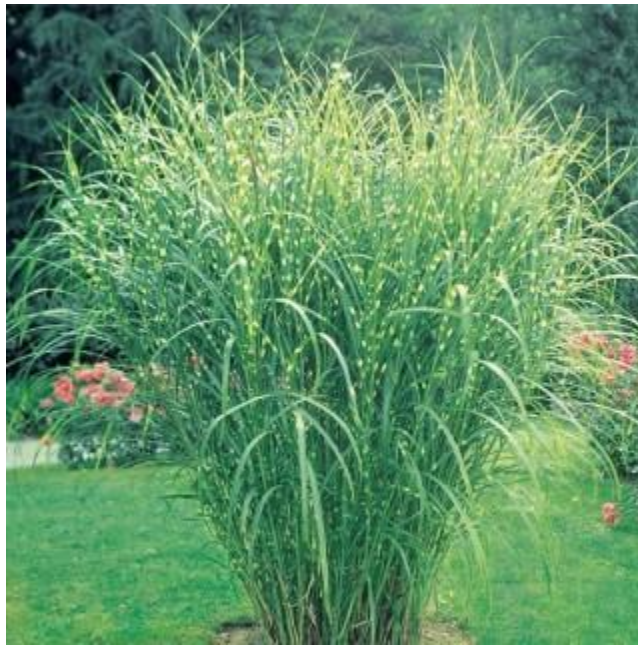
Figure 64 - Zebra Grass