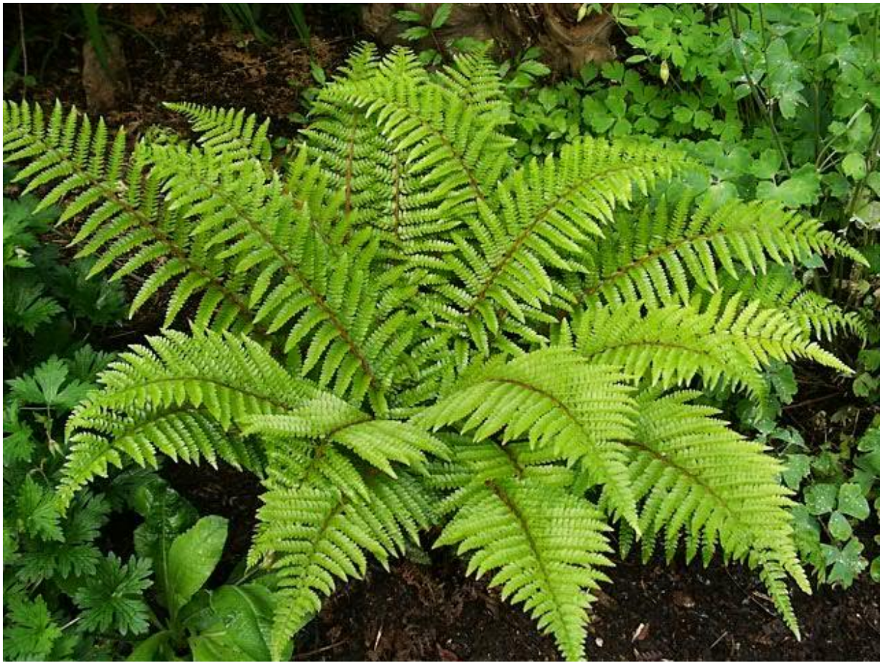
Figure 69 - Fern