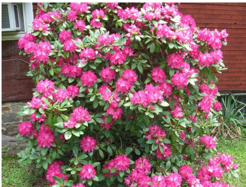
Figure 74 - Rhododendron Shrub

Rhododendrons and azaleas perform best in regions with cool, moist summers. They bloom in late spring to early summer; flower colors include pink, red, violet, yellow, and white, depending on the species and variety. Size also varies considerably, from 1 or 2 feet to over 20 feet in height, so choose plants carefully to fit your garden situation. Although the distinction isn't clearcut, in general rhododendrons are evergreen, while most azaleas are deciduous (although there are evergreen types).