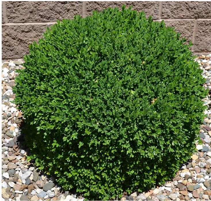
Figure 55 - Green Gem Boxwood