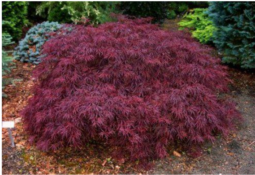
Figure 37 – Bloodgood Japanese Maple