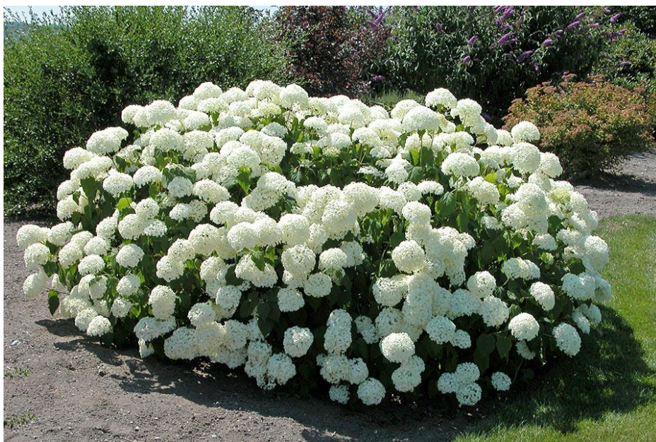
Figure 25 - Hydrangea During Bloom