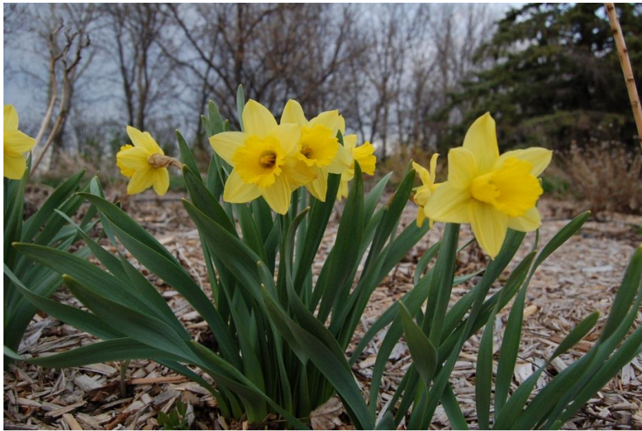
Figure 11 - Amazing Grace Daylily