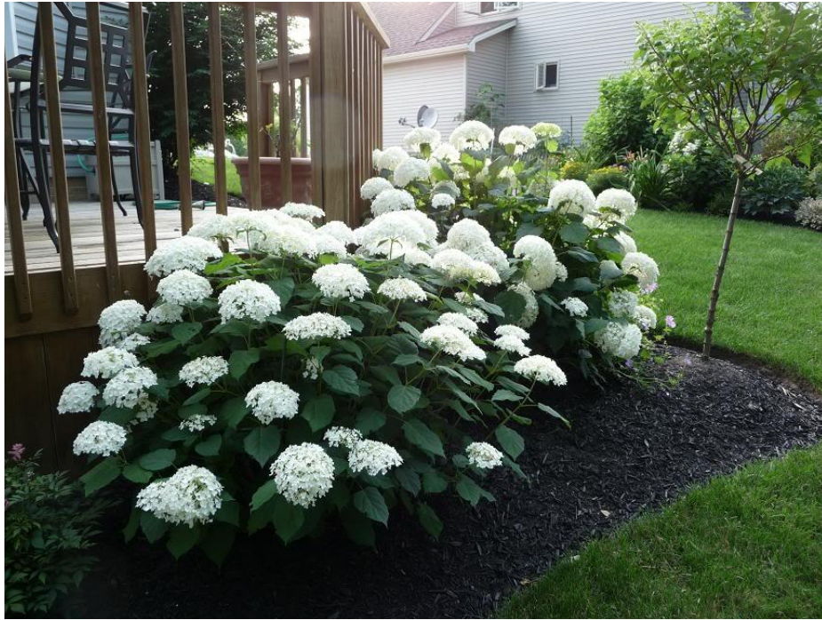
Figure 27 - Annabelle Hydrangea