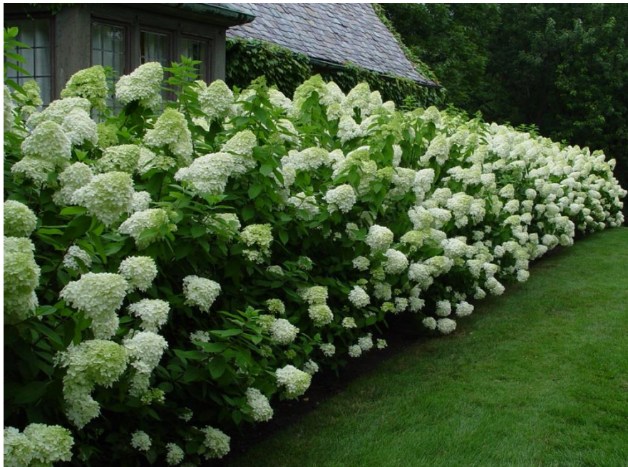
Figure 33 - Limelight Hydreangea