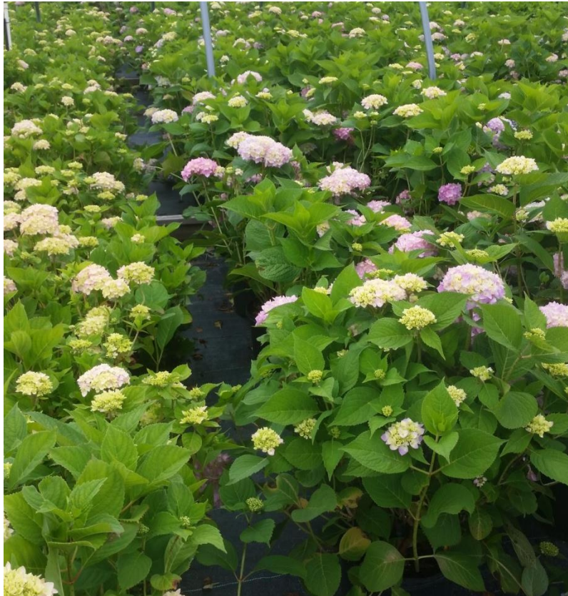
Figure 26 - Hydrangeas at the Nursery