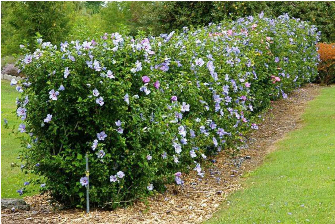
Figure 71 - Rose of Sharon Hedge