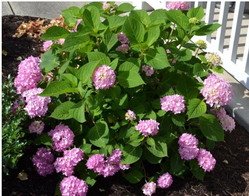
Figure 30 - All Summer Beauty Hydrangea

Flower: Pink or blue blooms depending on soil pH. For blue feed with aluminum sulphate