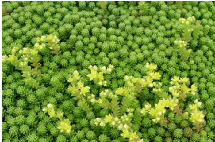
Figure 60 - Stone Crop as Ground Cover