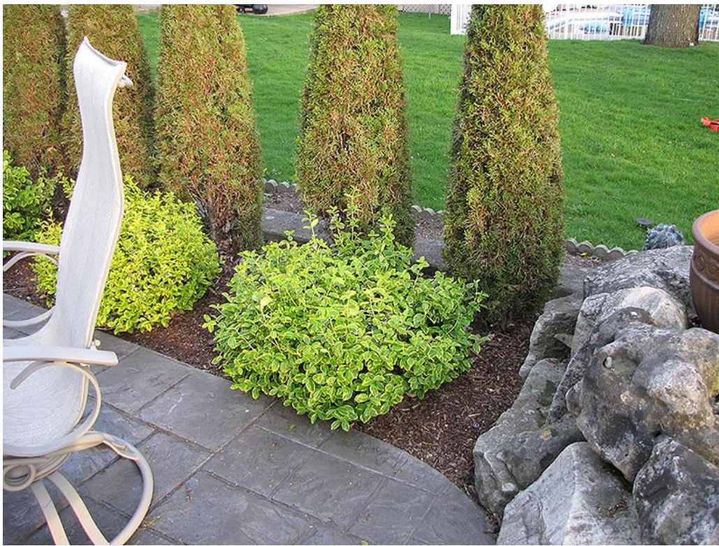
Figure 15 - Euonymus garden