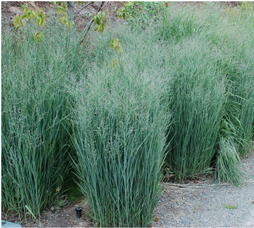
Figure 68 - Heavy Metal Switch Grass