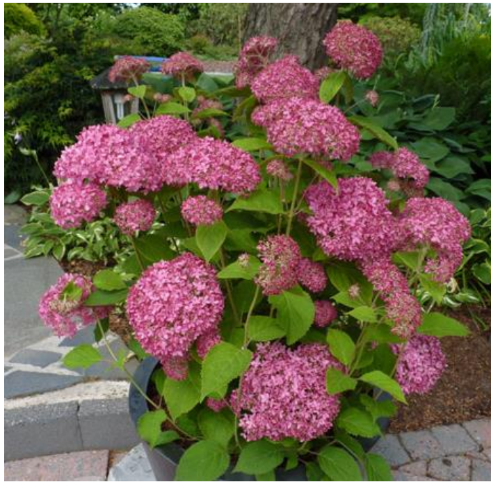
Figure 29 - Invincibelle Spirit Hydrangea