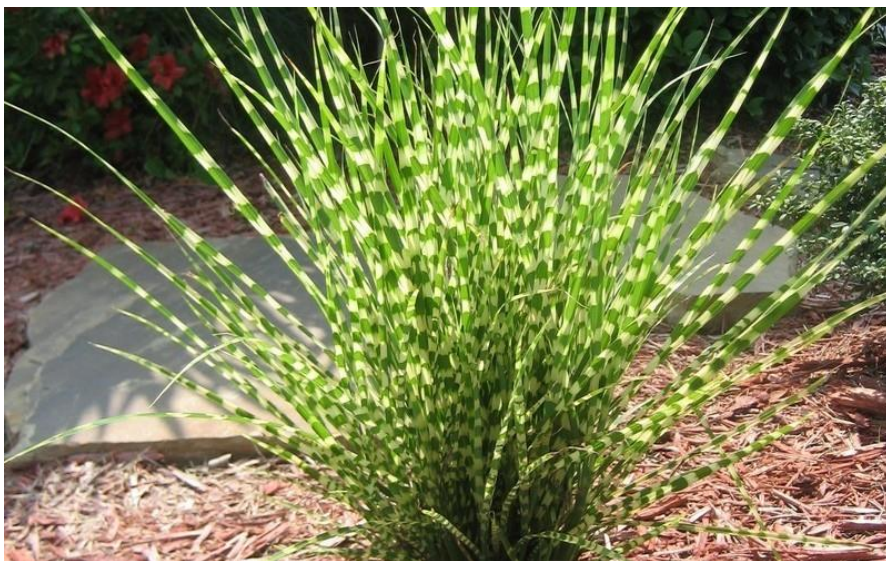
Figure 65 - Zebra Japanese Silver Grass

Uses: Full sun will bring out the best colour