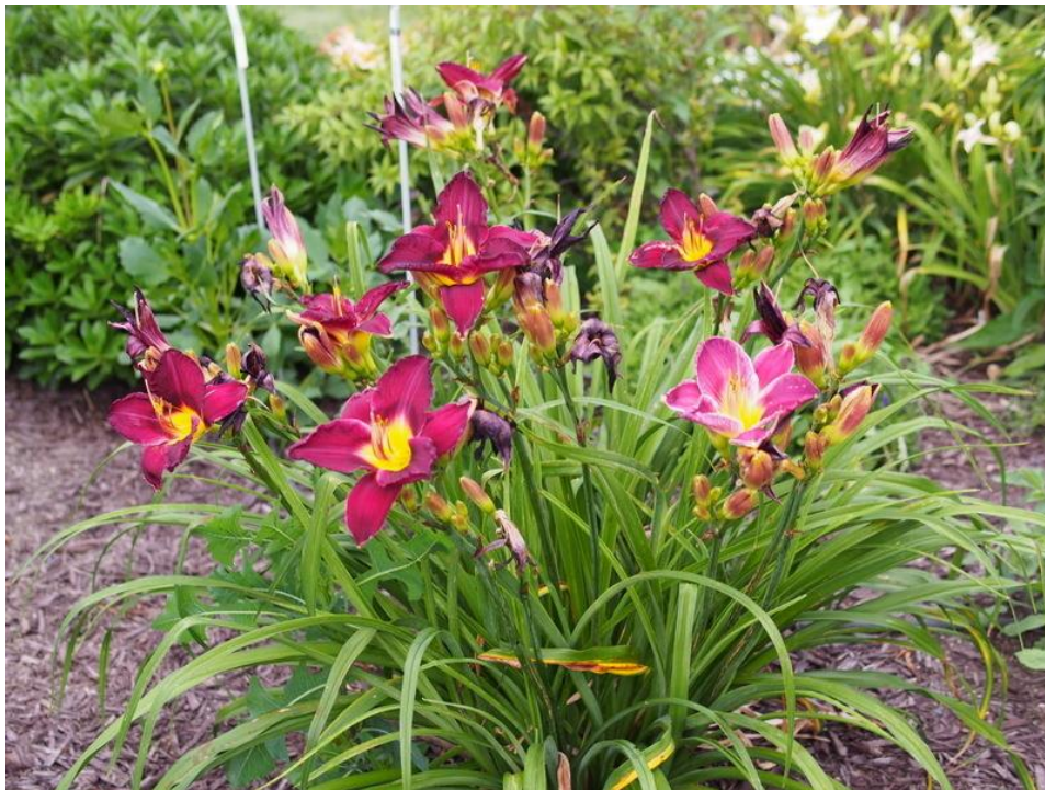
Figure 12 - Bella Lugosi Daylily