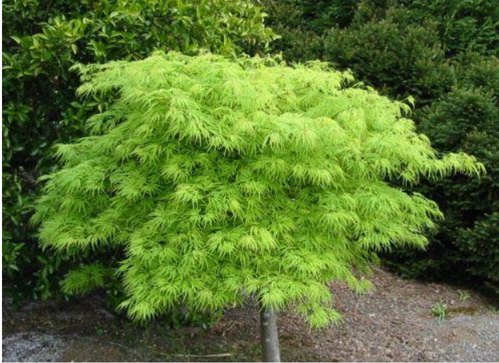
Figure 36 - Japanese Maple

Foliage: Bright Green Shape: Rounded Fall: Yellow and Orange