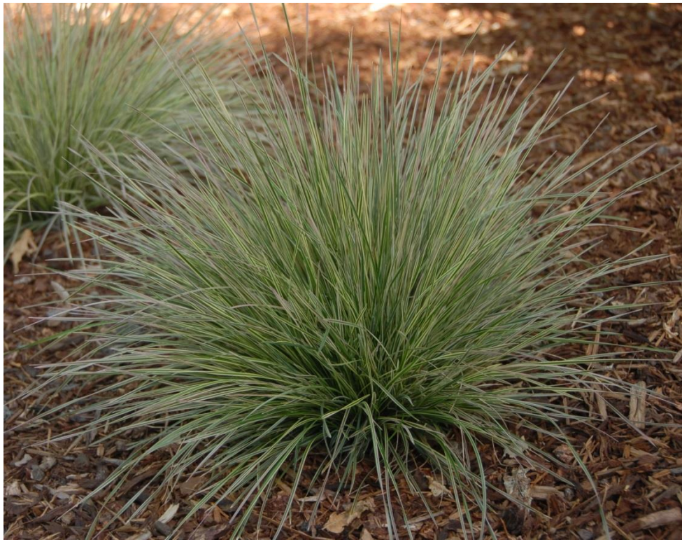
Figure 67 - Tufted Hair Grass