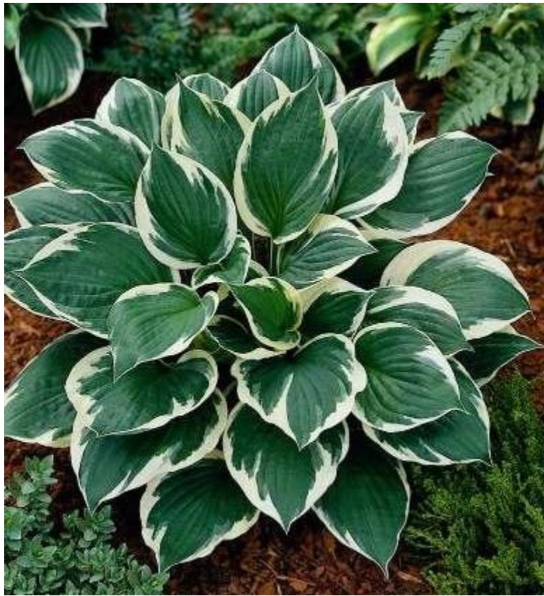
Figure 4 - Minuteman Hosta