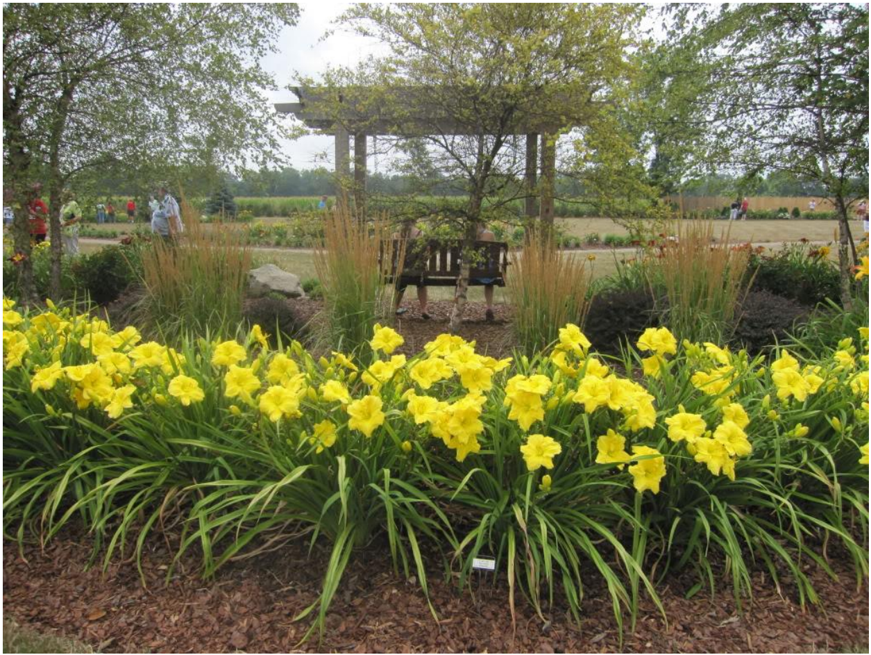
Figure 10 - Day lily garden an excellent way to keep weeds down