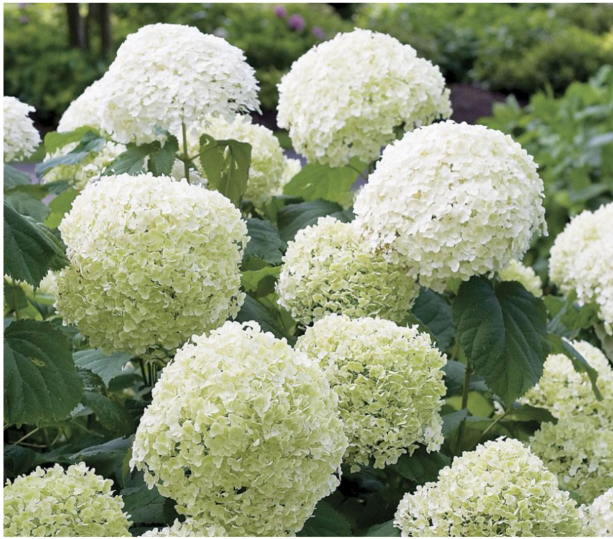
Figure 28 - Incrediball Hydrangea