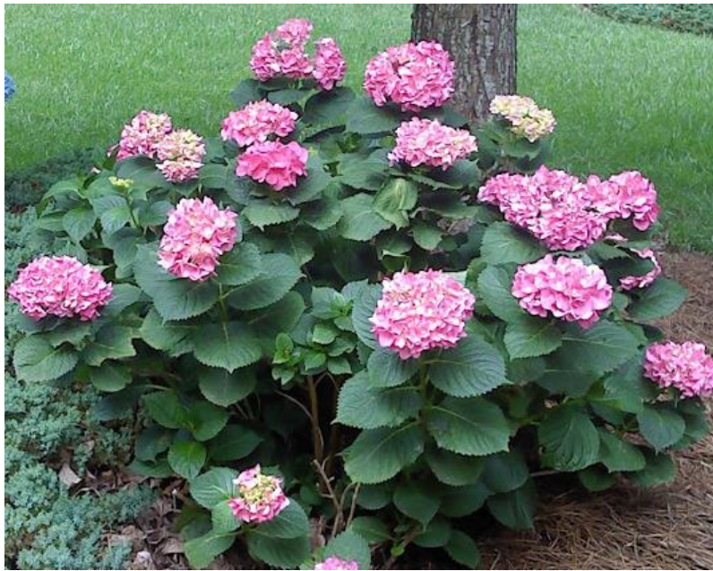
Figure 32 - Forever Pink Hydrangea