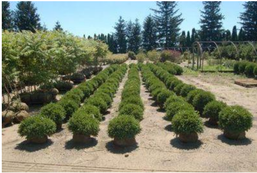
Figure 53 - Boxwood Cedar in Nursery