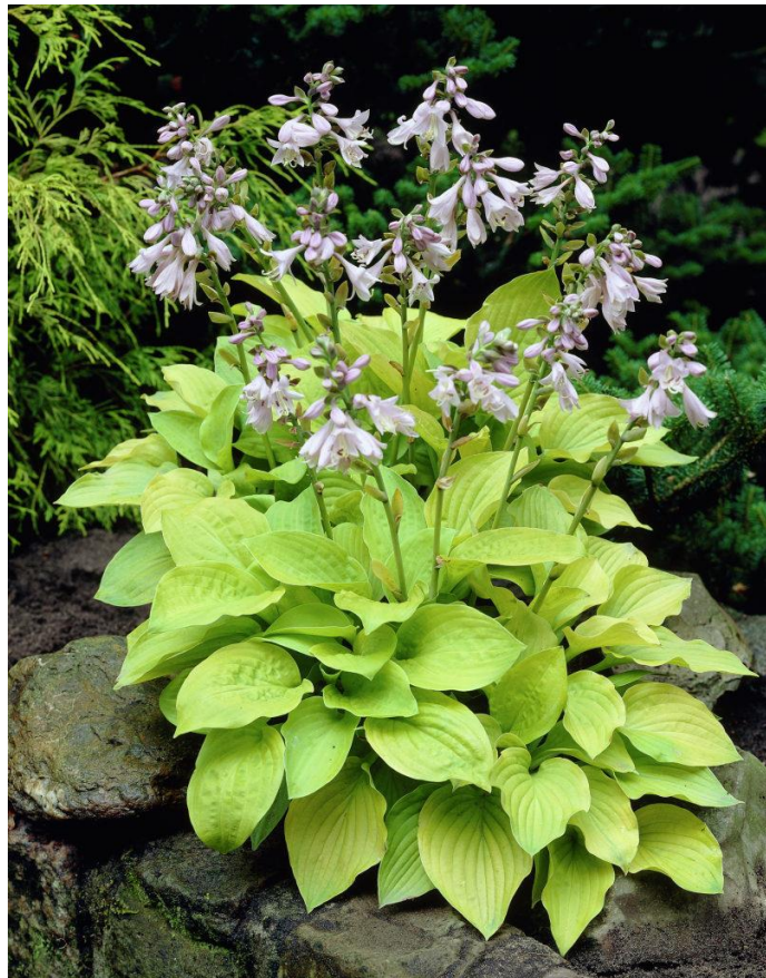
Figure 5 - August Moon Hosta