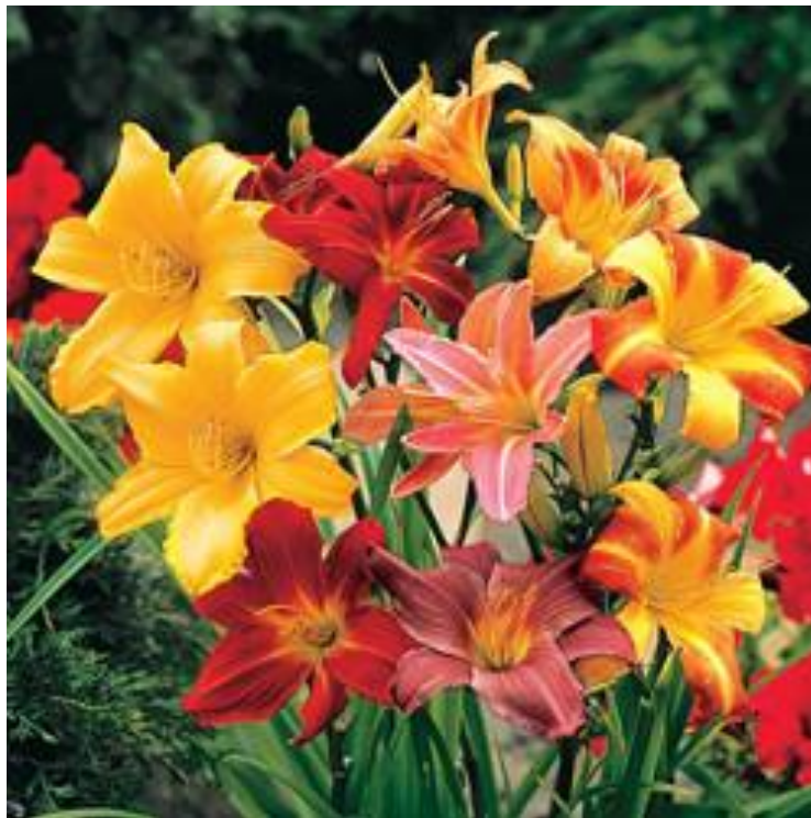
Figure 9 - Day Lily Flower Varieties