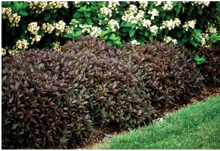
Figure 22 - Weigela Before Flowering