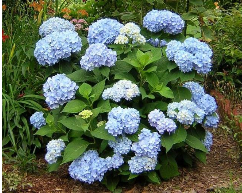
Figure 31 - Endless Summer Hydrangea

Flower: Shades of purple blues, and pinks, depending on soil pH. Repeat bloomer.