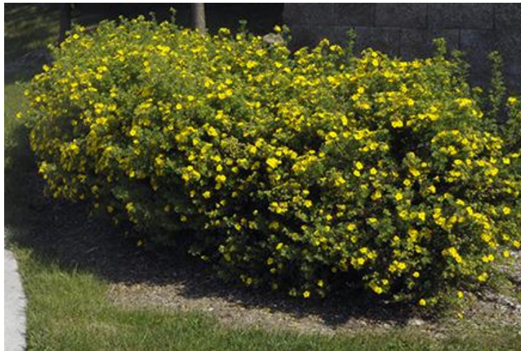
Figure 56 - Potentilla Shrub

Bright yellow flowers cover shrubby cinquefoil ( Potentilla fruticosa ) from early June until fall. The shrub grows only 1 to 3 feet tall, but what it lacks in size it makes up in ornamental impact. Gardeners in cold climates will find many uses for this hardy little shrub that thrives in climates as cold as USDA plant hardiness zone 2. Use it as a foundation plant, as an addition to borders, in mass plantings and as a ground cover.