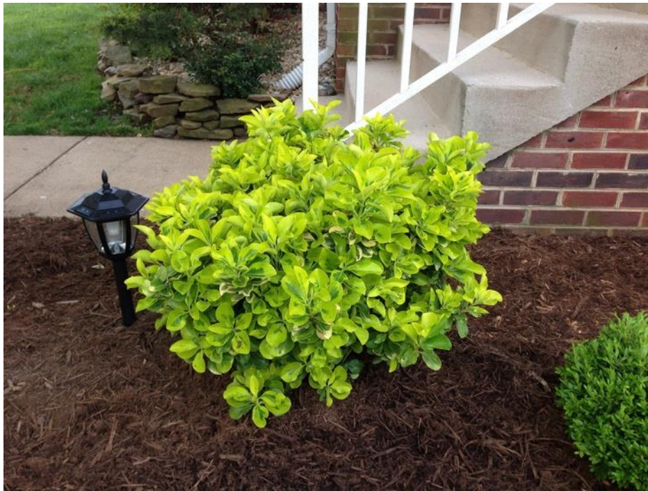
Figure 16 - Canada Gold Euonymus