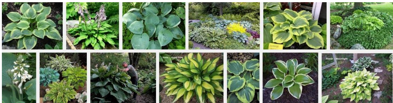
Figure 2 - Hosta Varieties