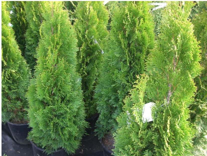
Figure 49 - Hedging Cedars in Pots