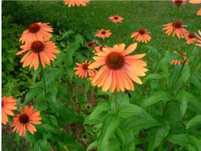
Figure 42 - Sundown Echinacea

Uses: One of the best oranges, very fragrant