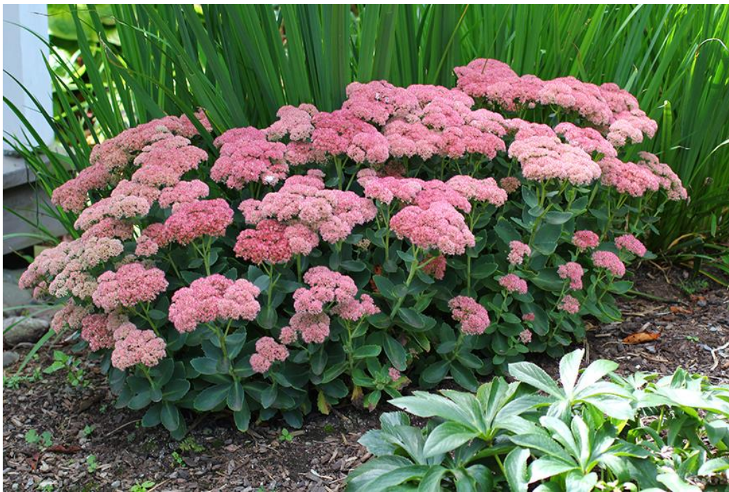
Figure 61 – Autumn Joy Stonecrop