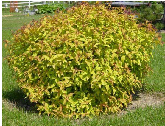
Figure 18 - Spirea Before Flowering