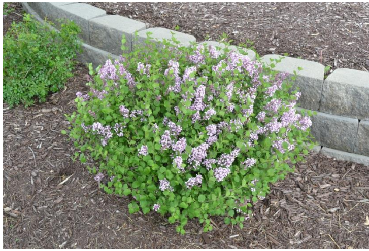
Figure 45 - Dwarf Korean Lilac