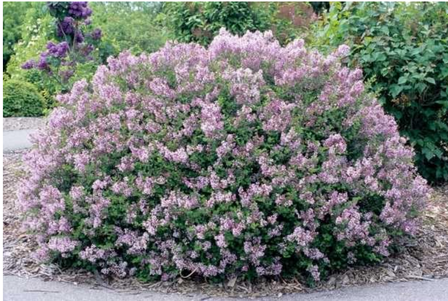
Figure 46 - Dwarf Korean Lilac