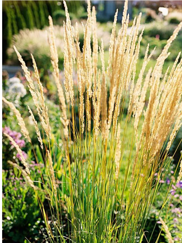
Figure 63 - Feather Reedgrass

The most popular ornamental grass, feather reedgrass offers a distinct upright habit that looks fantastic all winter long. Like many grasses, this tough plant tolerates a wide range of conditions.