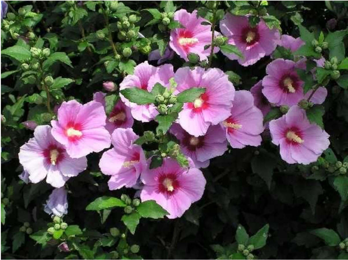
Figure 70 - Rose of Sharon Flowering