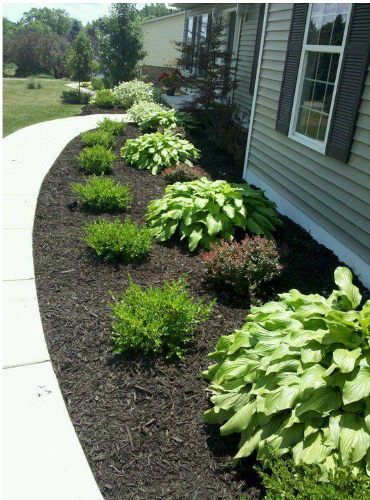
Figure 3 - Hosta Garden