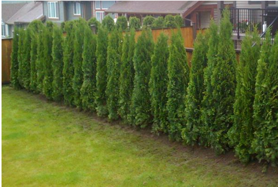
Figure 51 - Hedging Cedars