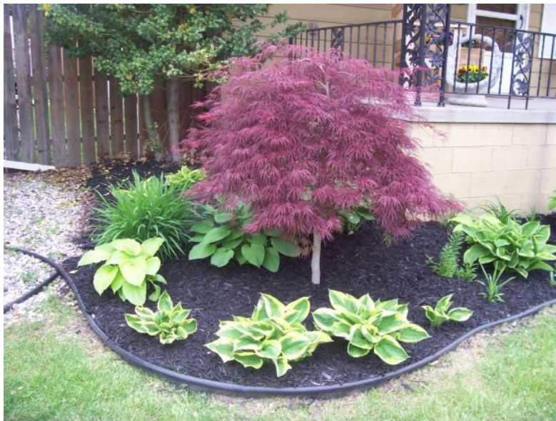
Figure 35 - Pruned Japanese Maple