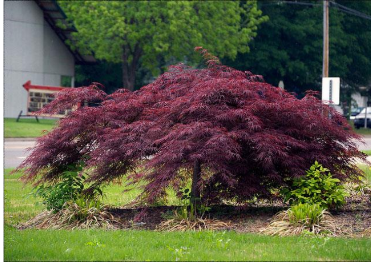
Figure 34 - Japanese Maple

Japanese Maples have interesting foliage and colour. They also have great 'shape' which is so critical in design. We use them as a highlight plant in many applications. For years, our favourite was 'Bloodgood' - that is, until Emperor 1 came along. It is similar to 'Bloodgood', but holds it's great red colour for almost all of the summer. The red stays red! This great plant is also easy to grow.