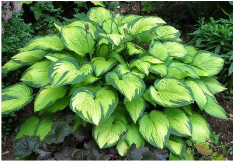
Figure 6 - Gold Standard Hosta