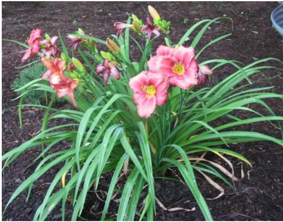
Figure 14 - Rosy Returns Daylily