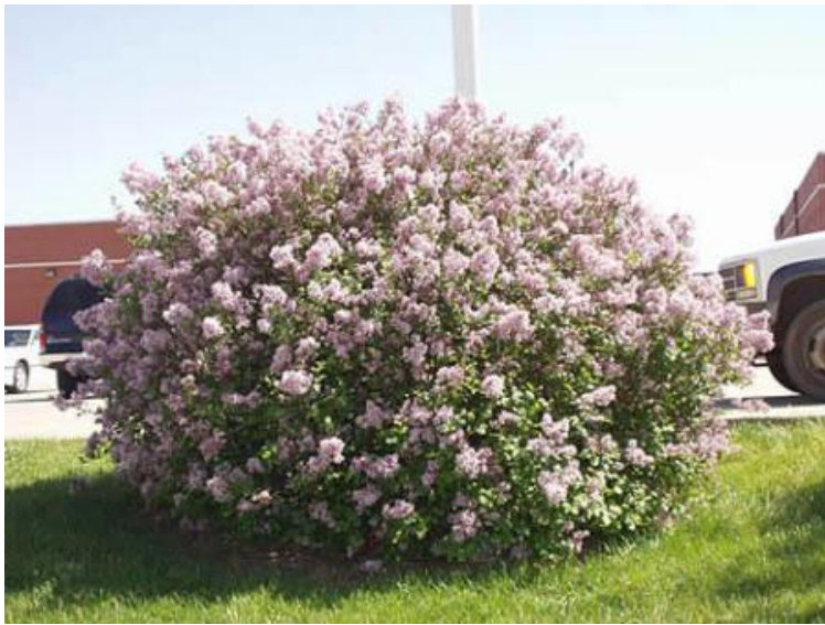
Figure 43 - Dwarf Korean Lilac