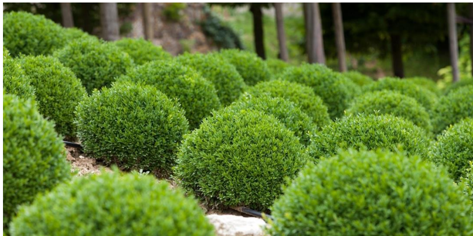
Figure 52 - Boxwood Cedar Shape Example

The common boxwood is a large shrub, or even tree, if left completely alone. However, most people know it as a small shrub with dense foliage most commonly used in hedges. One of the most popular evergreen shrubs used in hedges it is widely used in Europe and more recently in North America.