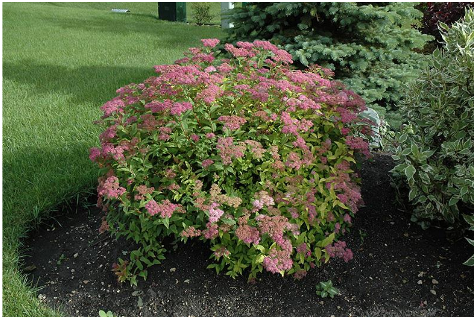
Figure 17 – Spirea