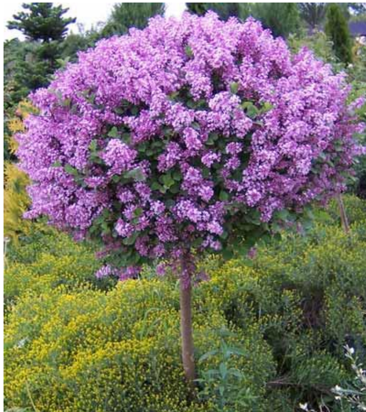
Figure 44 - Korean Lilac Tree