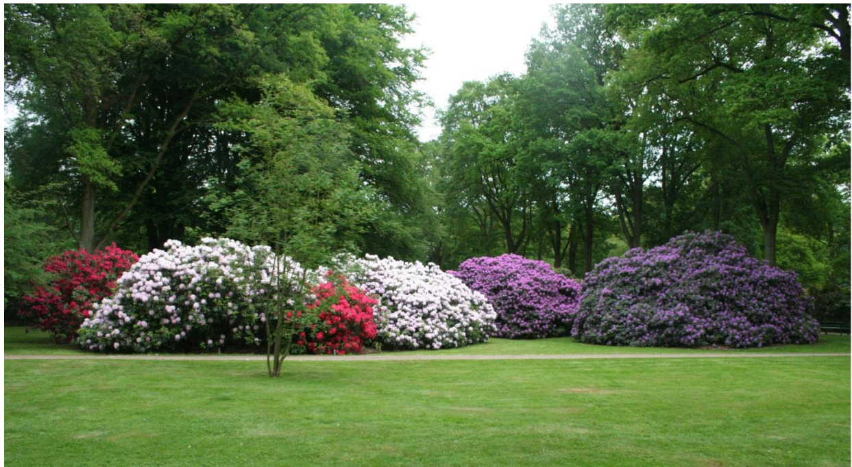
Figure 75 - Rhododendron Colours