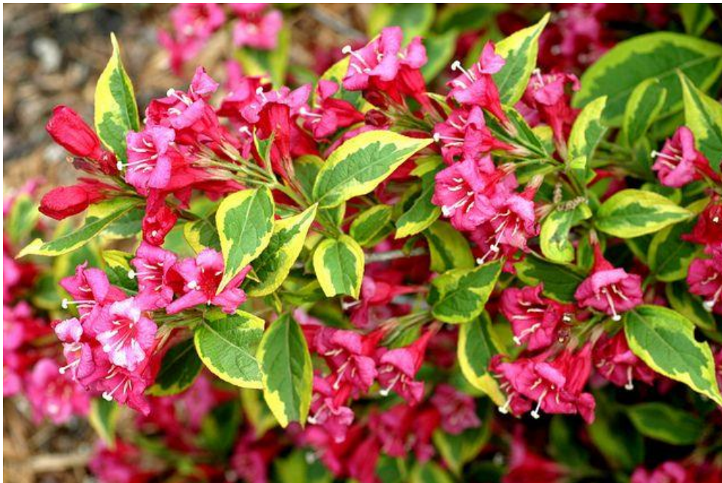
Figure 23 - Merlot Rose Weigela