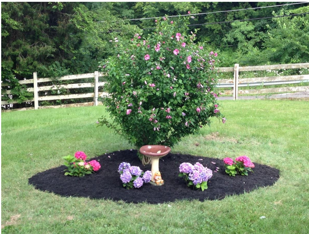
Figure 72 - Rose of Sharon Garden with Hydrangeas