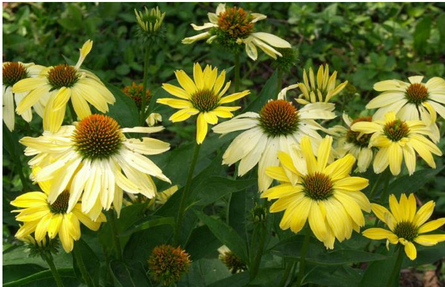
Figure 41 - Sunrise Echinacea

Flower: Large, fragrant new flowers are a golden yellow colour, while more mature flowers are a butter yellow, combining to create an attractive mix of yellow hues