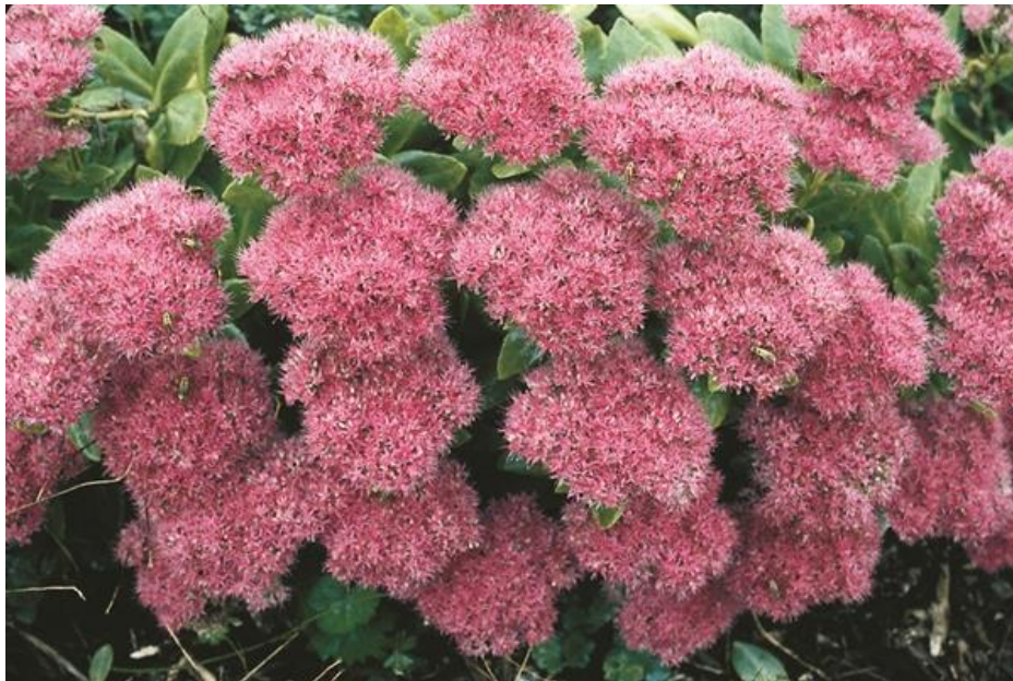
Figure 59 - Stone Crop Flowering