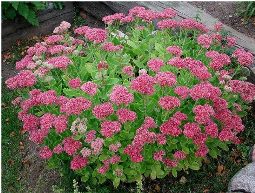
Figure 62 - Brilliant Stonecrop