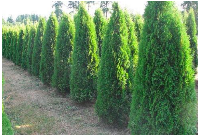
Figure 50 – Hedging Cedars at Nursery