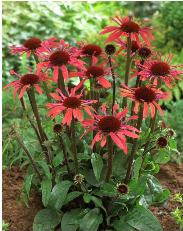
Figure 39 - Echinacea Sunset