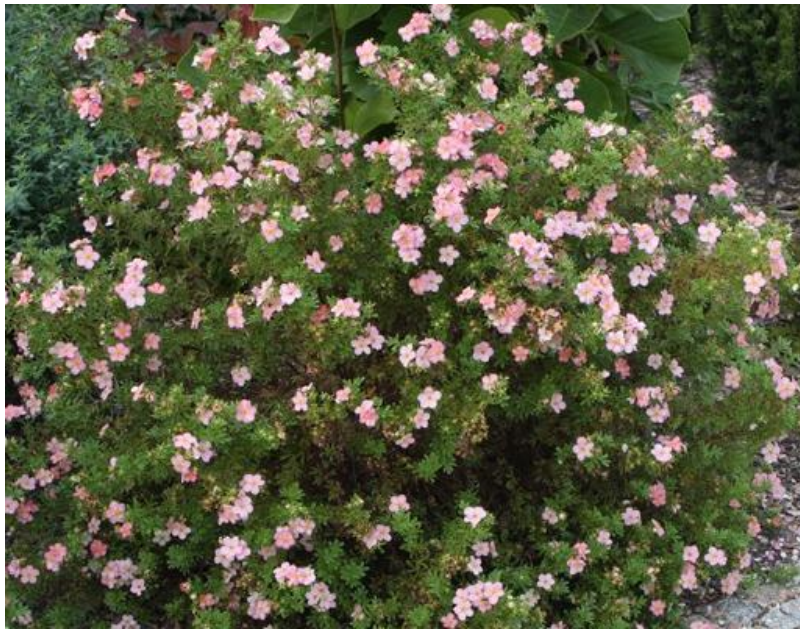
Figure 58 - Pink Beauty Cinquefoil Potentilla