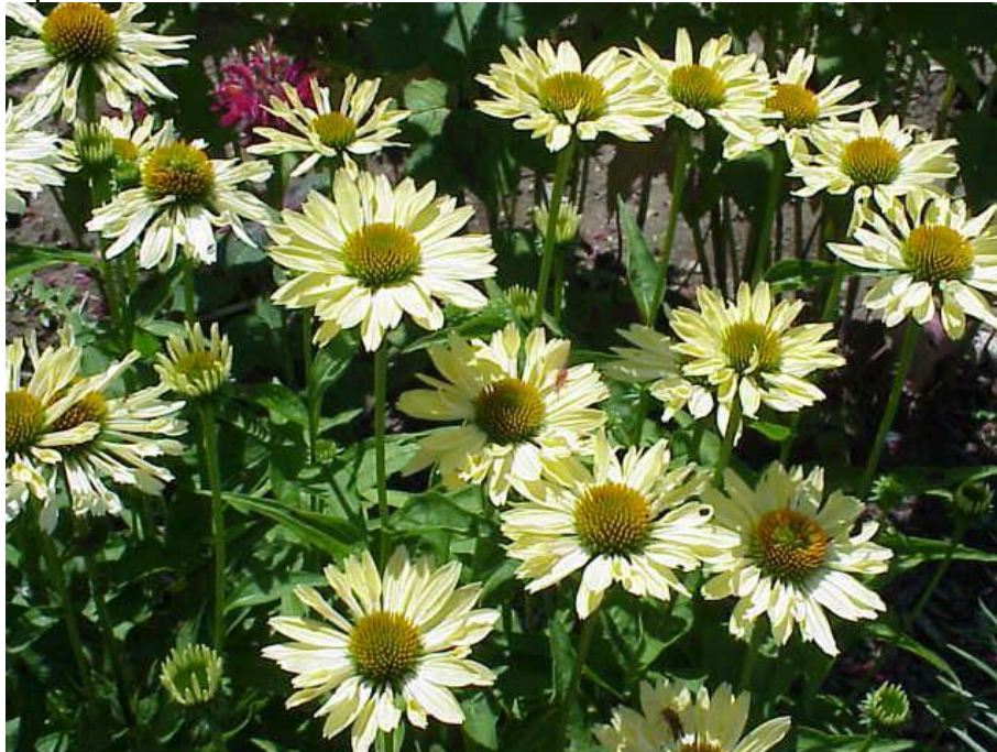
Figure 38 - Echinacea Sunrise

Echinacea 'Sunrise' and 'Sunset' are two of the showiest perennials we have ever seen. Bred by IT Saul in U.S., this is one of a series of amazing new coneflowers. With huge flowers and great colours, 'Sunset' has orange tones with roses and hints of blue undertone, wonderful reflexed petals and a huge 'cone.' 'Sunrise' is just a big sassy bright yellow. Both are easy to grow and will overwinter will in Ontario gardens. These plants will make a nice indoor cut flower as well as a great border plant. We like to plant them in groups of at least 5 plants - pick odd numbers to avoid planting in straight lines or squares. Typically about 50 cm tall in the garden - plant in full sun.