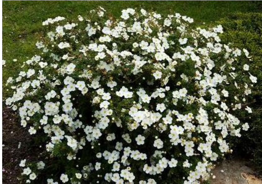
Figure 57 – Abbotswood Cinquefoil Potentilla