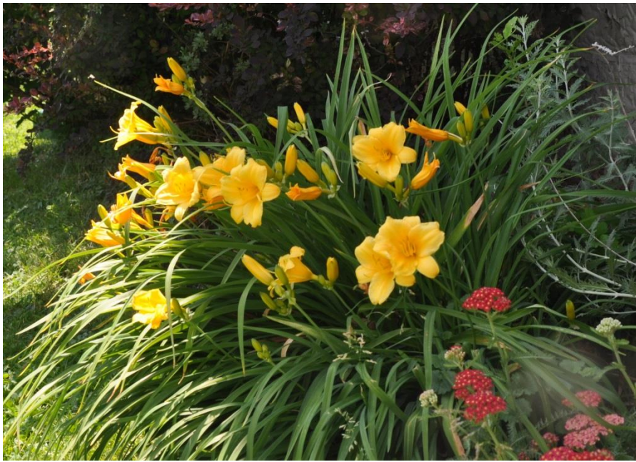
Figure 8 - Day Lily