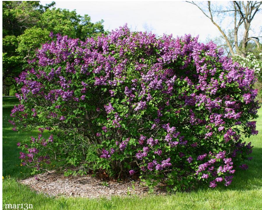
Figure 47 - Common Lilac