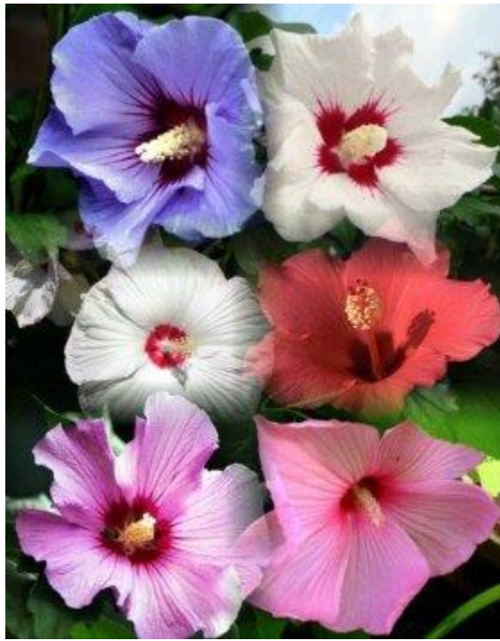
Figure 73 - Rose of Sharon Flowers