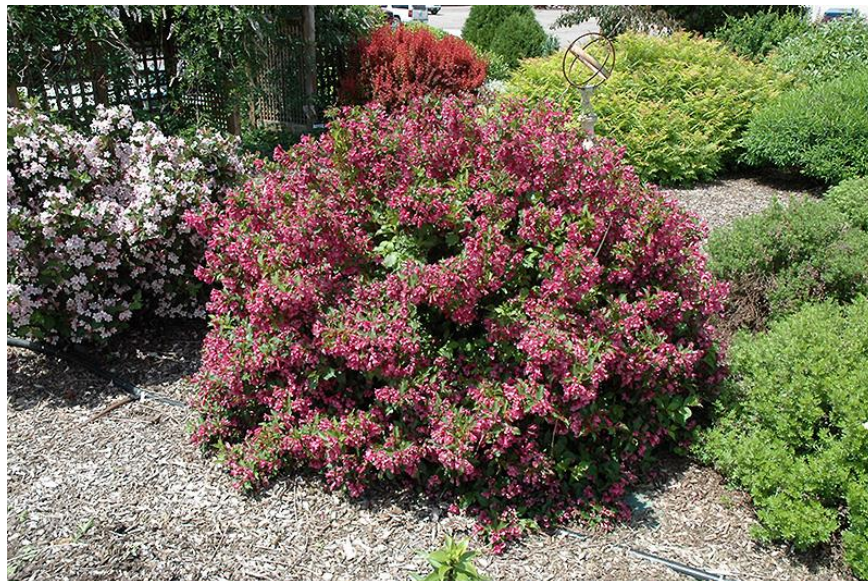
Figure 21 - Weigela Bush