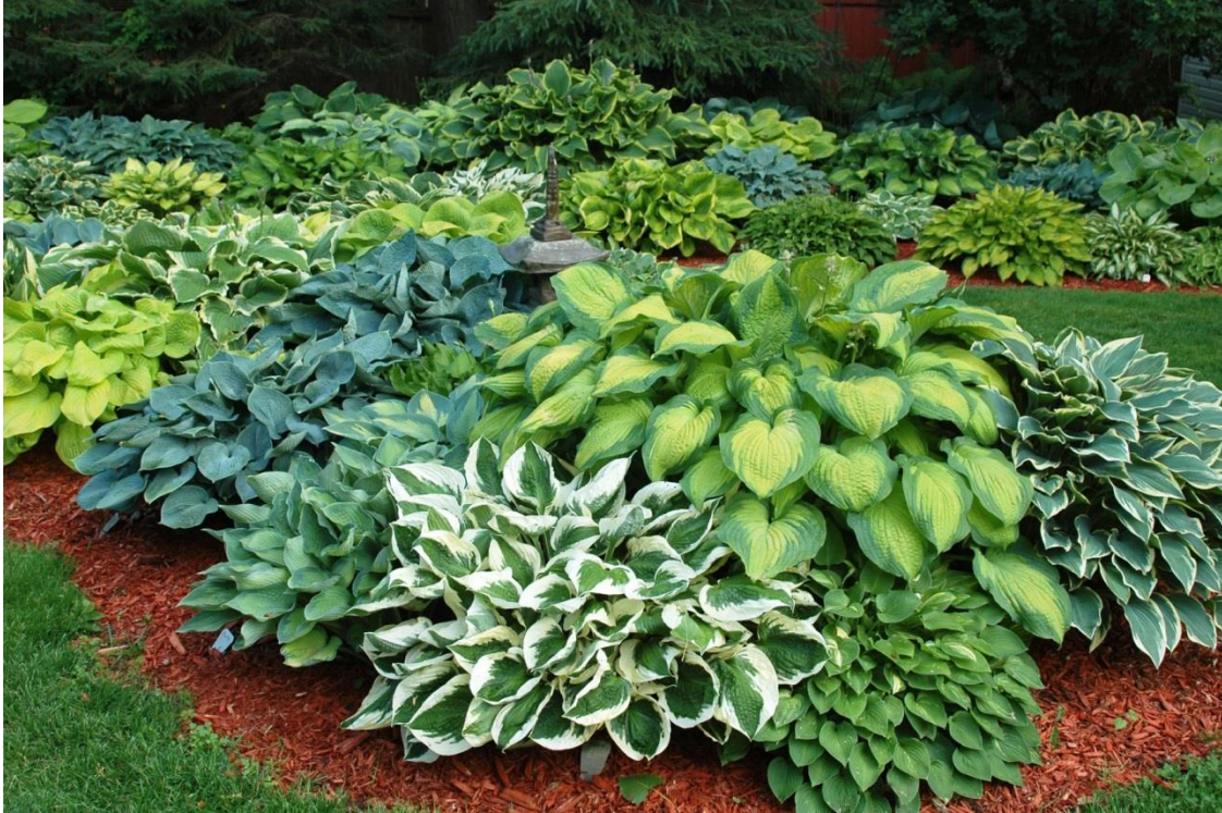
Figure 1 - Hosta Garden

The longevity of perennials is the main reason why people choose to plant them in their gardens. If selected well and planted in the right way, they will provide you year after year with colour and foliage for about 15 years on average. And you can usually share your perennial plants with your friends and neighbours by splitting either the root or the green part of the plant. You can also share the success of your healthy plant with your neighbour without going to buy a new plant all together.