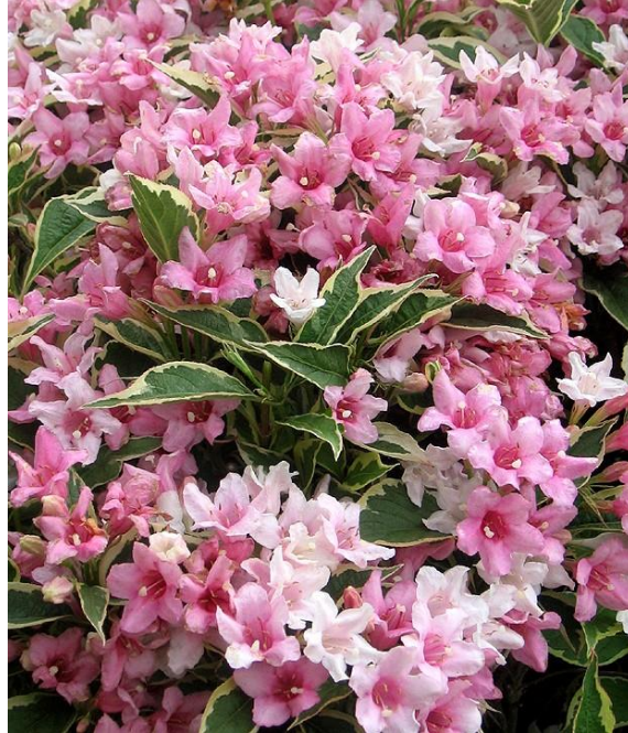
Figure 20 - Weigela Flowers

The fruit is a dry capsule containing numerous small winged seeds.